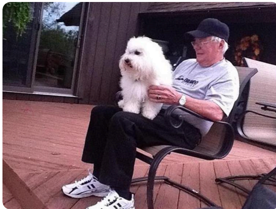
Dad and his grand dog, Rêve.