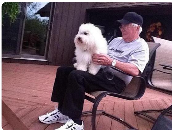
Dad and his grand dog, Réve.