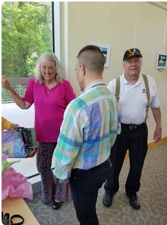
Dad and his friends