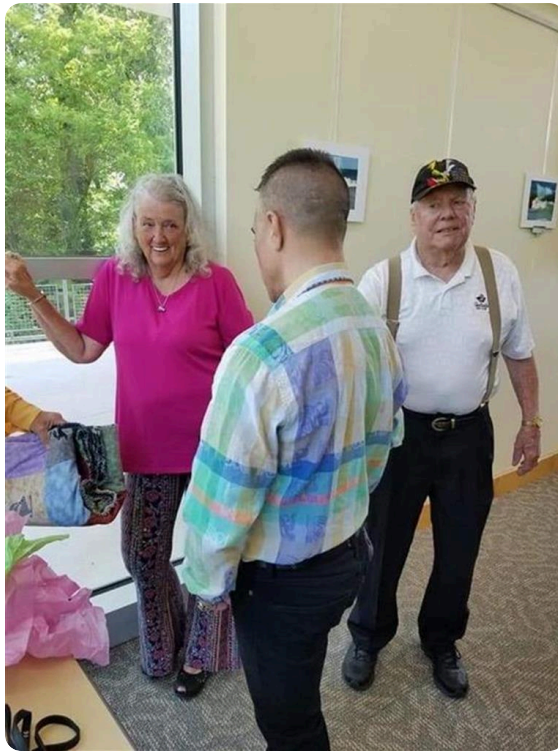
Dad and his friends